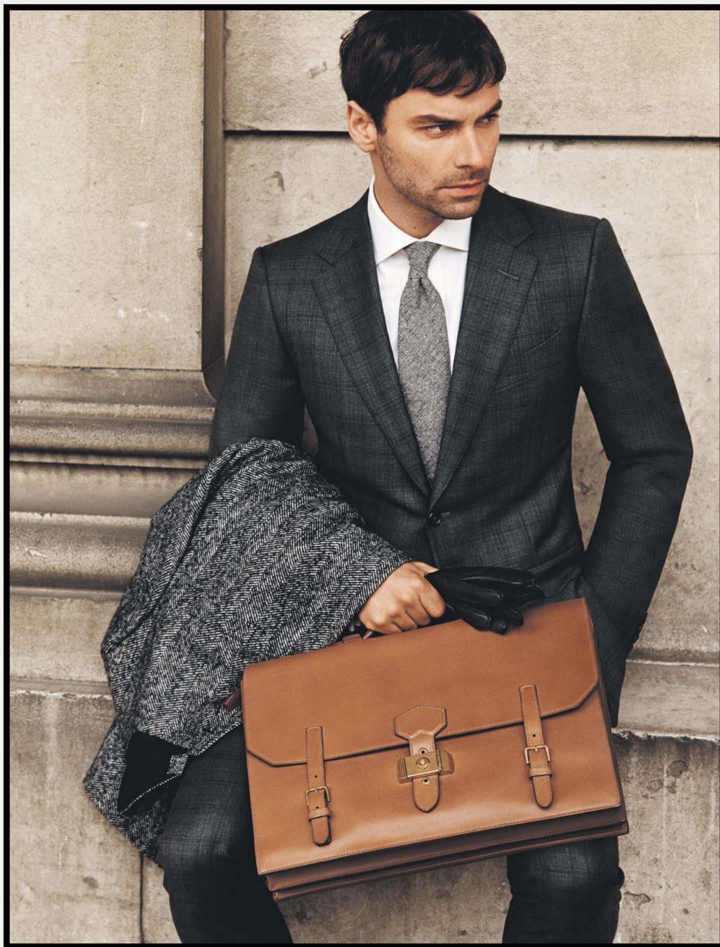
Aidan Turner, London, May 2017